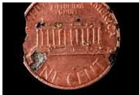
You Won't Believe What We Found Inside The New 2015... Stansberry Research