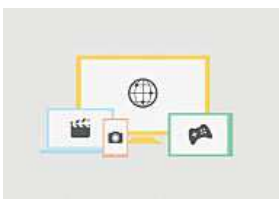
Get Fios Now, and Get Super Fast Streaming Speeds. Verizon