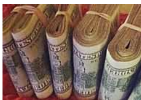
Brilliant Mortgage Payoff Method Has Banks On Edge Comparisons.org