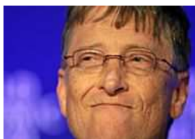
The Golden Age is Over: Billionaires Dumping American... Money Morning Report Subscription