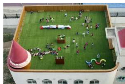
Our top photos from the last 24 hours. Slideshow »