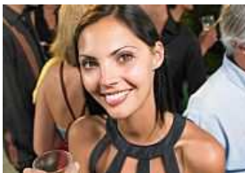
Why You Should Be Ordering Your Wine Online The Huffington Post | Tasting Room