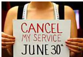
There's Trouble Brewing for America's Most Hated... The Motley Fool